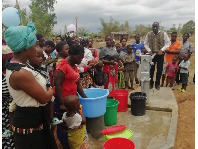
Life giving water flows from a borehole drilled in Mpheta, Malawi

Boreholes have been drilled at locations such as churches, prisons, schools, colleges, hospitals, childcare facilities, a library, and a police station. They serve areas of varying sizes from a few rural households to communities of thousands.