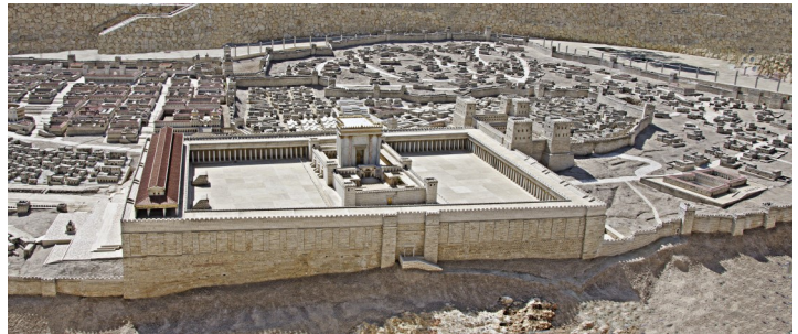
A model of ancient Jerusalem from the Israel Museum

The Lord had known all along that He would make this fateful trip to Jerusalem one day. He would lose all protection and become the object of not only the wrath of mankind but also the wrath of God. This was not only sheer determination and willpower to do the job He was called to do, it was also the determination to face the greatest physical, emotional, and mental torture ever suffered by anyone in taking