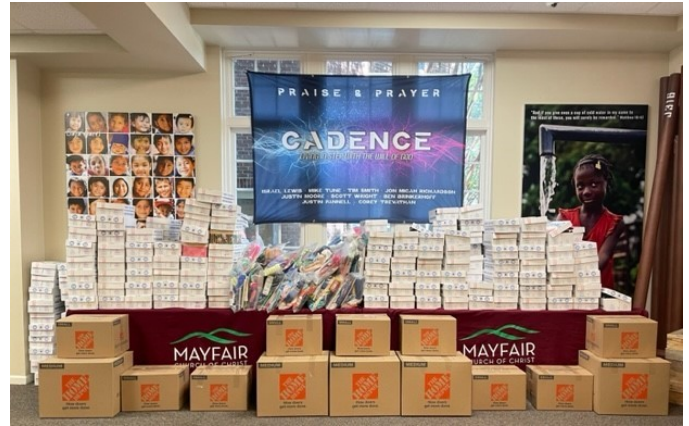
MAGI boxes are packed and ready to ship

Shop for MAGI all year. Check sales and clearance tables for listed items. Look into the other activities of Healing Hands International. They organize, you just show up to follow directions and help. Check out